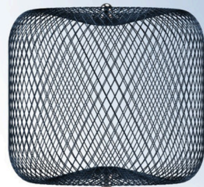
WEB™ Aneurysm Embolization System